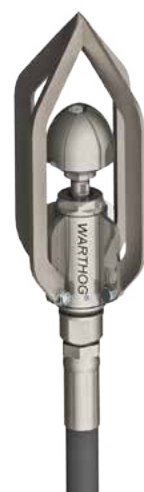
Warthog 3/4" con 5370.10